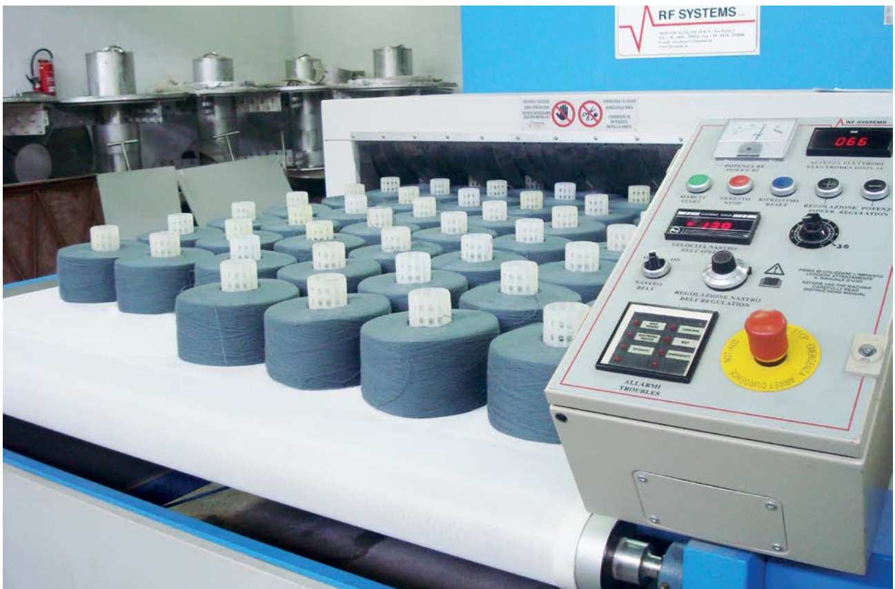
100% polyester bobbins