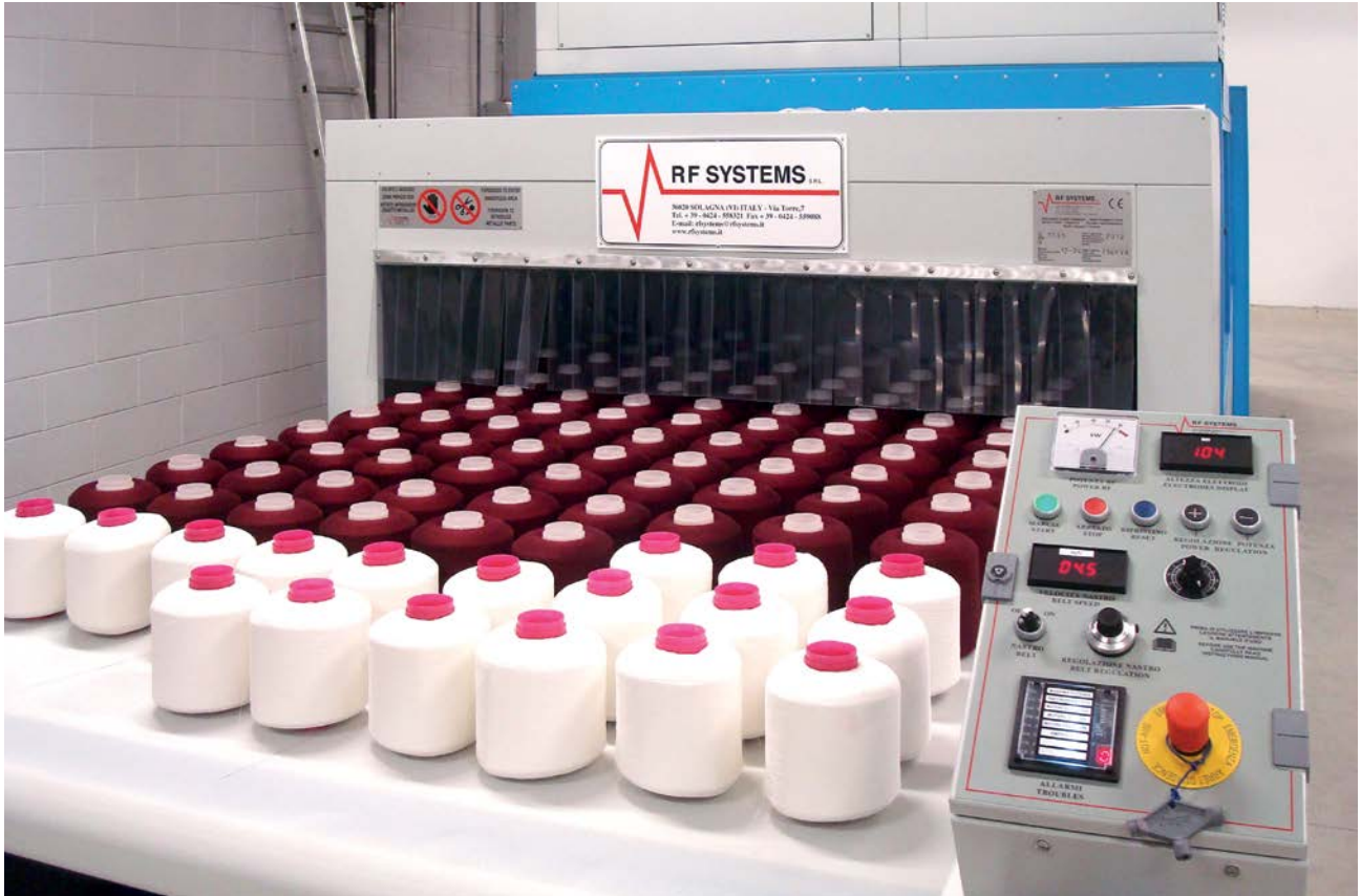
100% cotton bobbins